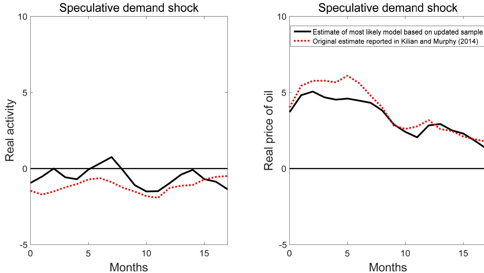
Figure 3: The robustness of the Kilian and Murphy (2014) response estimates

NOTES: The plot shows the responses of the original estimate selected by Kilian and Murphy (2014) as well as the corresponding responses from the most likely model obtained when evaluating the Kilian and Murphy model on updated data ending in August 2017. The most likely model was selected using the methodology of Inoue and Kilian (2013, 2018). The two estimates are quite similar, contrary to the claim made by BH.