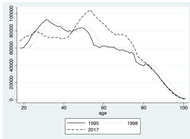
Figure 3: Population Distribution by age

Note: Number of Swiss citizens by age. Data are from the 1990 and the 2016 Swiss Business Census. Age X in 1995 (1998) corresponds to age x-5 ( x-8 ) in 1990. Age X in 2017 corresponds to age x-1 in 2016.