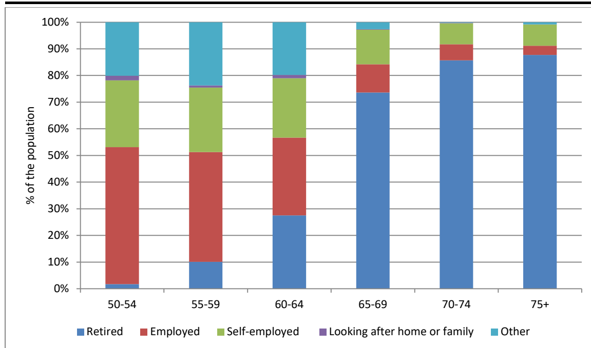
FIGURE 2a Current Employment Status, by Age (% of the population), Men, 2010

Note: Population weights are employed. The category 'employed' includes those in other categories who undertook paid work for at least one hour in the previous week. 'Other' includes the unemployed, permanently sick or disabled and in education or training groups.