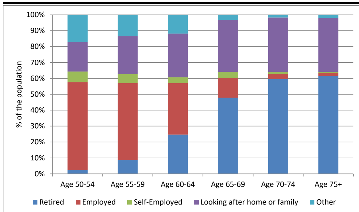
FIGURE 2b Current Employment Status, by Age (% of the population), Women, 2010

Note: Population weights are employed. The category 'employed' includes those in other categories who undertook paid work for at least one hour in the previous week. 'Other' includes the unemployed, permanently sick or disabled and in education or training groups.