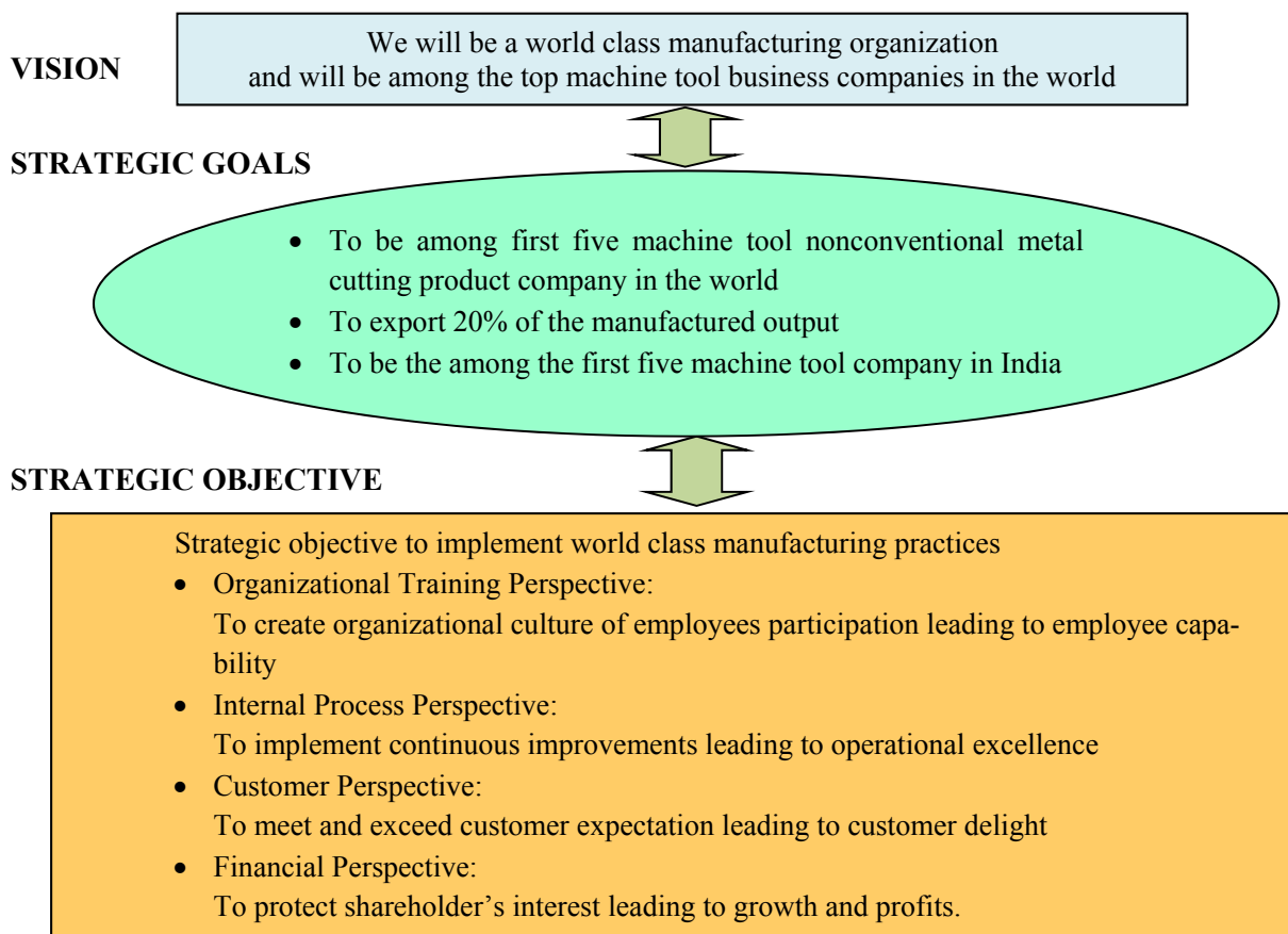
Figure 2. Vision and strategy for the machine tool organization "X"

For our organization, which was into the machine tool industry, we formulated the vision, framed the strategic goals, and defined the strategic objectives as shown in Fig. 2.