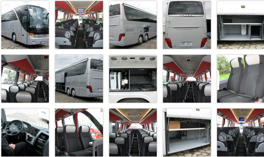
Figure 1. Coach SETRA S 416 HDH

COACH Setra S416 HDH – 58 seats (55+2+1), equipped with air conditioning, Blaupunkt - Coach 2000 DVD radio set, DVD, two 19-inch monitors (liquid crystal), toilet, cafe bar, kitchenette, refrigerator, air conditioning, reclining and movable seats with leather headrests, armrests and adjustable footrests, folding tables by each seat, large space between the seats (which significantly increases travel