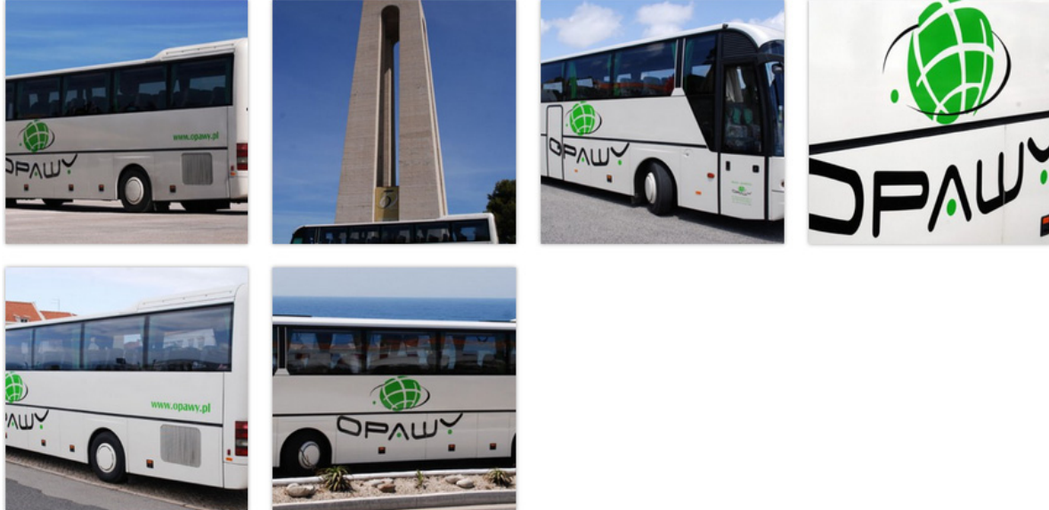
Figure 3. Coach NEOPLAN N 316 SHD

ing and movable seats with armrests and adjustable footrests, folding tables by each seat, overhead night lamp, overhead air vent, curtains, seatbelts in unsecured seats.