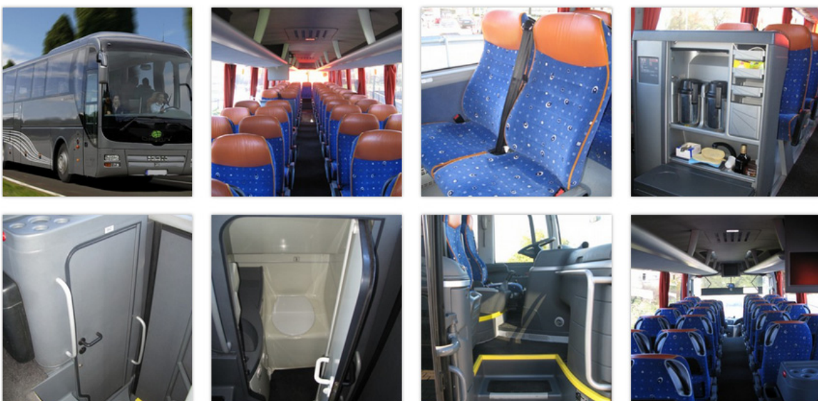
Figure 2. Coach MAN RHC 464

COACH MAN RHC464 – 59 seats (57+1+1), equipped with air conditioning, DVD, 2 monitors, toilet, cafe bar, reclining and movable seats with armrests and adjustable footrests, folding tables by each seat, overhead night lamp, overhead air vent, curtains, seatbelts (Kulińska, 2015).