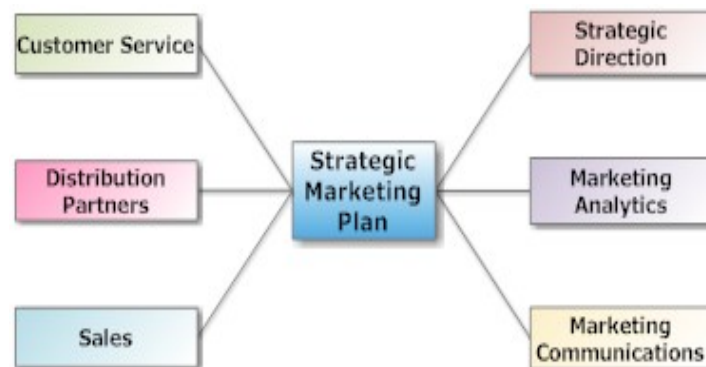
Figure 2. Strategic marketing planning

The strategic marketing planning process is a well-researched field of marketing management and much literature exists on the subject. The process of developing strategies has been described over the years using various terminology including budgeting, long-range planning, strategic planning, and strategic market management. The different terminologies has similar meanings and are often used interchangeably. However, when they are placed in a historical perspective, some useful distinctions emerge. Strategic planning, the emergence of which is associated with the 1960s, 1970s, and 1980s, is concerned with changing strategic thrusts and capabilities. However, strategic marketing planning focuses on the market environment facing the small business. In Fig. 2, the elements of strategic marketing planning are shown.