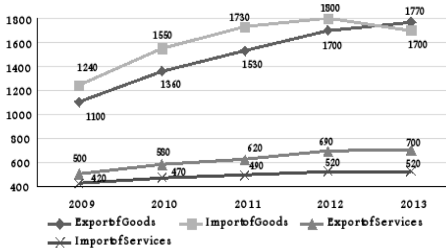
Figure 1. Export and import of goods and services to third countries (outside the EU-27) in billion EUR, 2009–2013