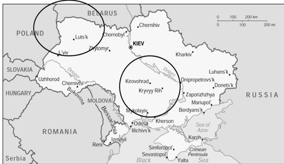
Figure 1. Study area

Western Ukraine Oblasts: Lutsk (16 rayons), Rivne (16 rayons), Chernivtsi (11 rayons), Lviv (19 rayons) Southern Ukraine Oblasts: Herson (17 rayons), Odessa (26 rayons)