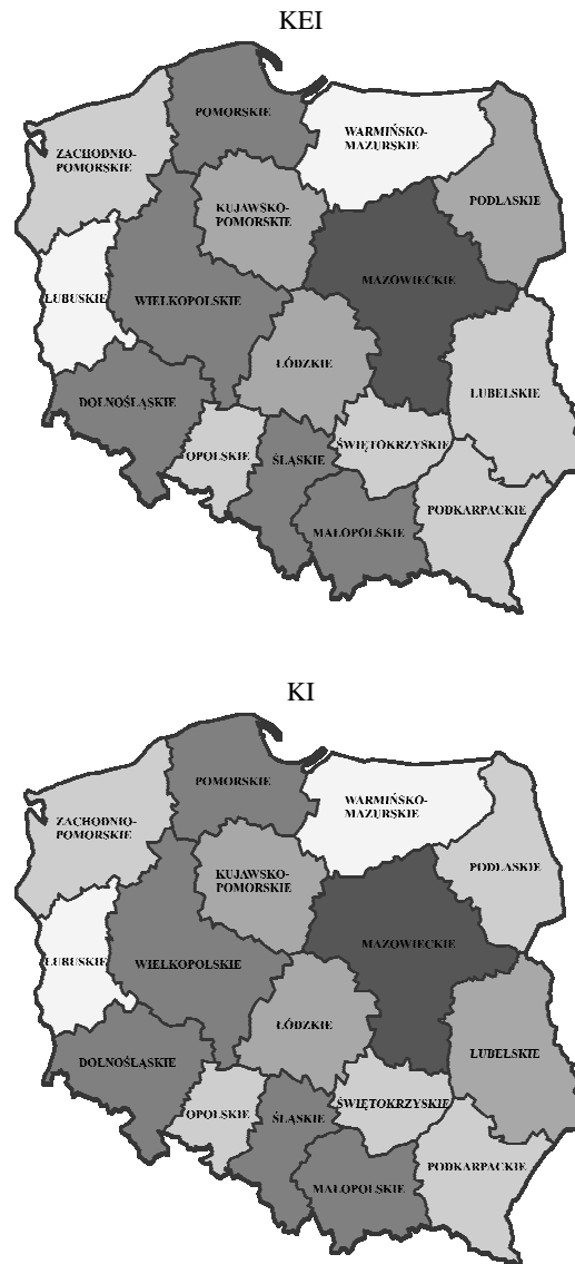
Figure 3. Maps of the KEI and KI 2011

In order to observe the spatial relationship (see figure 3) maps of KEI and KI, for the year 2011, as for 2003 were constructed. Similarly to figure 2, the darker colour means the higher value of the measures and the lighter colour, the lower value of the measures.