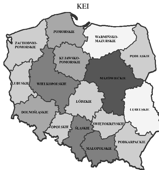
Figure 2. Maps of the KEI and KI 2003