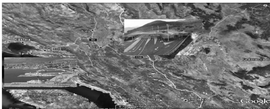
Figure 3 Smuggling of goods of high tariffs in Bosnia and Herzegovina

Thus, it can be concluded that the smugglers quite well designed; planned and carried out phase transport operation through the EU, and without no problems and smooth, by using existing legislation they perform the transportation operation, preceding the act of smuggling.