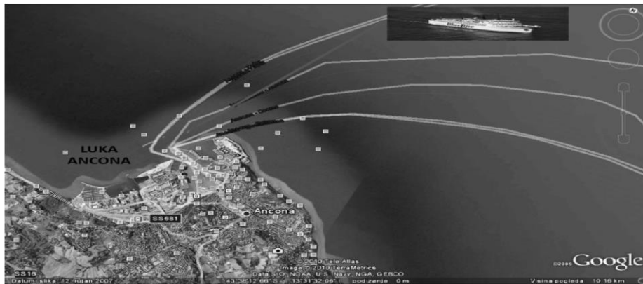
Figure 2 Transit through Italy

transport, using false documentation non-existent companies from Bosnia and Herzegovina, smugglers had no problems transporting such goods in Croatia. Given that this was a luxury goods transit through Croatia to Bosnia and Herzegovina as a country of destination, Croatian customs authorities carried out a procedure for the transit of goods through high tariffs through that country. It entailed monitoring the departures and transportation luxury goods until leaving the Croatian. The analysis of the transit documents transit procedure has been implemented in accordance with the usual procedure of customs authorities of the Republic Croatian.