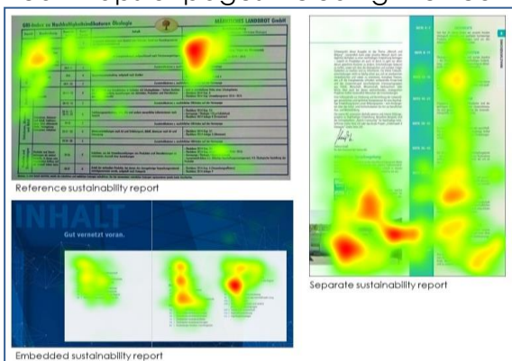
Figure 2 Heat maps of pages including their contents (absolute duration)

*Note: Absolute duration is calculated by the duration of fixations, whereas the warmest color represents the highest value.