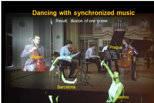
Figure 3 Global Performance for APAN38

A slightly different GP was prepared for the APAN38 held in Taiwan. The performance was called „Dancing in Space“. We again collaborated with partners across continents. In this case, one big screen was used to compose video of musicians and dancers together. The main video of a musical trio was transferred from Prague and into it was composed live video of a cellist who played in Miami (US) and dancers who danced in Barcelona (Spain) and in Nantou (Taiwan). The final screen from this performance is shown on Figure3.