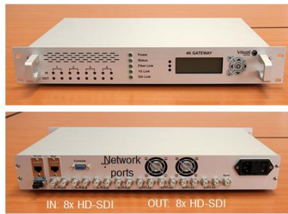
Figure7 MVTP-4K Box Enabling Multiple Video Transmissions