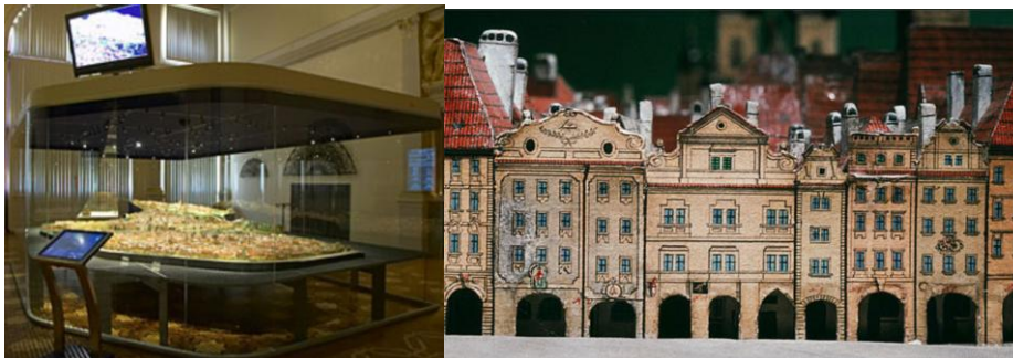
Figure 4 Langweil Model in Prague Museum (left) and Zoomed Details (rights)

Source: Photographs are a reproduction of a collection item administered by the City of Prague Museum, the author of the item is Antonin Langweil