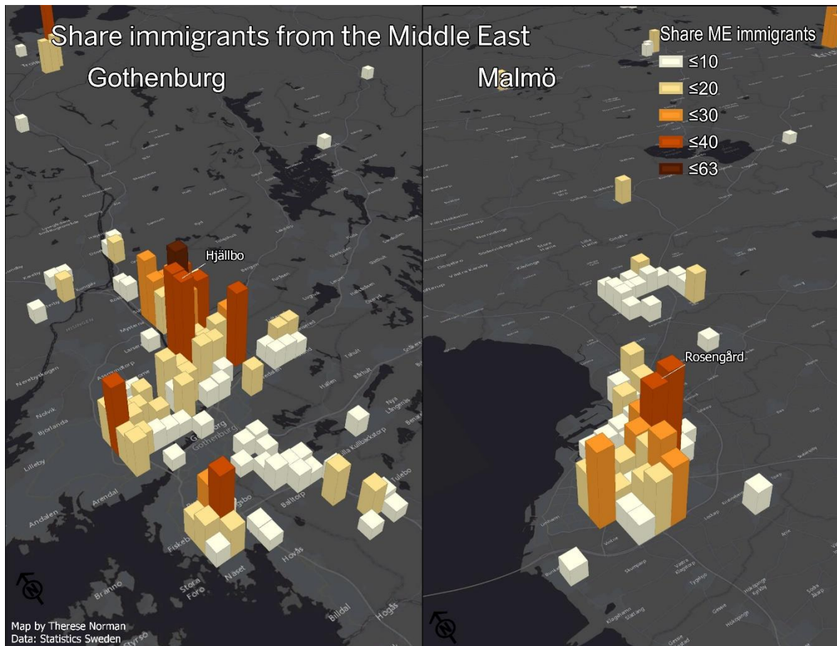
Figure 2. Share of immigrants from the Middle East in Göteborg and Malmö labor market region 2011.