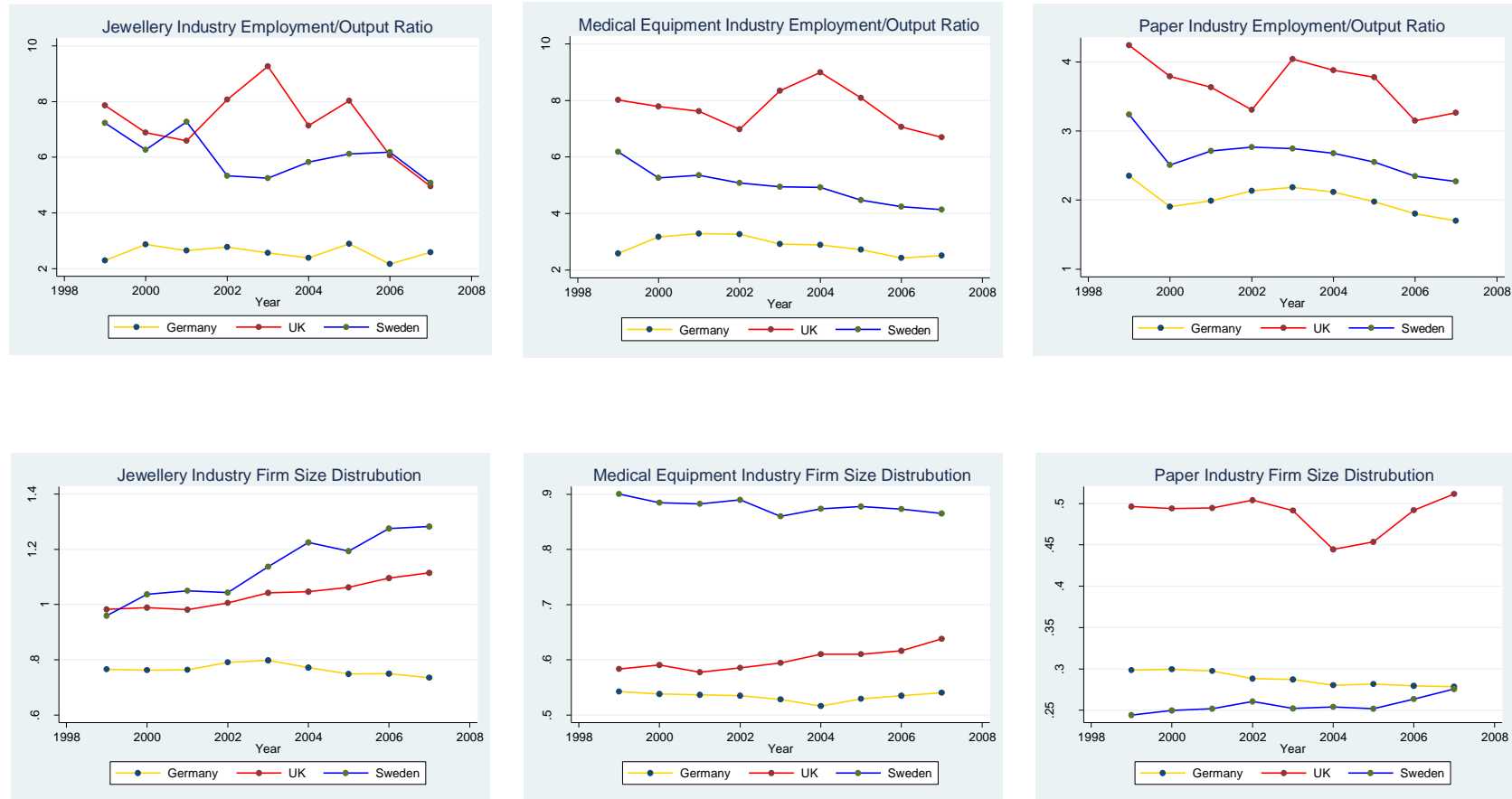
Figure 3. Inter-Industry and Inter-Country Differences in Employment/Output Fluctuations and Firm Size Distribution