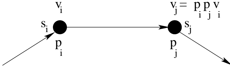
Figure 1: Information transfer on a path.

Fig. 1 illustrates this idea by looking at two adjacent nodes on a path. The expected value of information at node j is p_i p_j V_i , i.e., node j gets the information only when nodes i and j survive with probability p_i and p_j respectively. The expected benefit to player i is given by p_j V_i , i.e., player i 's benefits depend on the survival probability of player j . Hence the payoff to player i is \Pi_i = p_j V_i - c_{ij} .