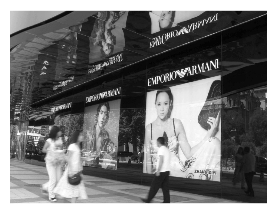
Image 8. Armani engages globally known Asian actors/actresses to suggest its brand's global fame while at the same time localizing its appeal. Here the film stars of the 2005 release "House of Flying Daggers" Zhang Ziyi and Takeshi Kaneshiro are featured.