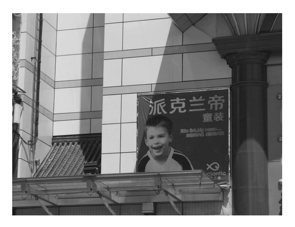
Image 5. Even Caucasian children are used as models in this advertisement for Paclantis, which sells children's clothing and plays up Western-ness, despite its Asia-Pacific origins. Paclantis, founded in 2002, has survived the years of market competition. This brand, created by a business man from Taiwan, is "pacificatlantic" → Paclantis, though the translated name PaiKeLanDi is used on all marketing activities. The translated name gives people a subtle implication that this is a western brand. Not surprisingly, the image of a white boy is used on its ad/poster.