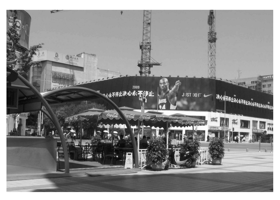
Image 6 and 7. Western sports brands, such as Nike, also convey Western otherness through use of internationally famous sports celebrities.