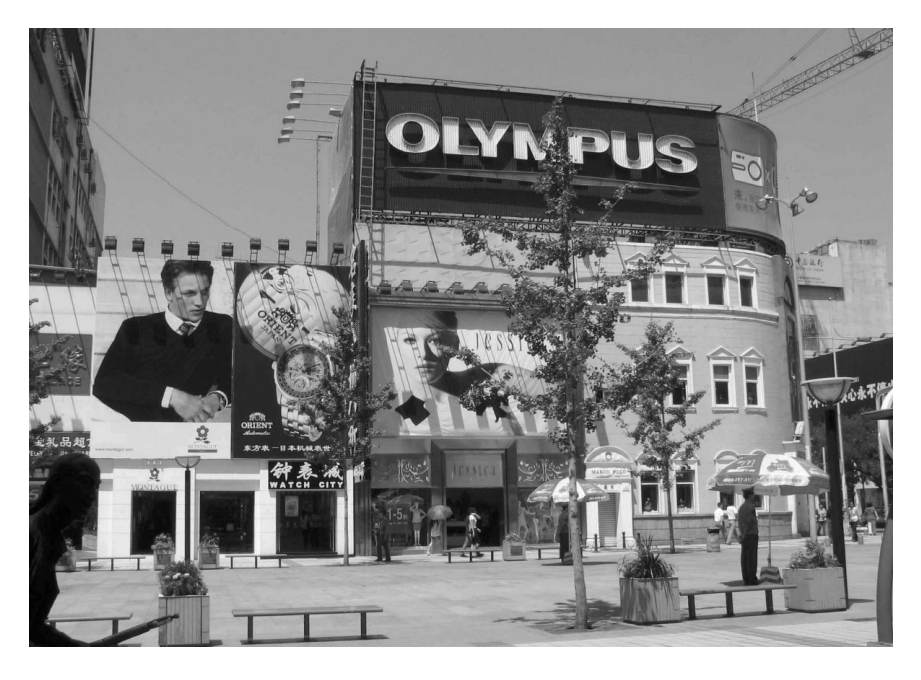
Image 1. Outdoor advertisements of Western brands are a prominent part of China's consumption-scape. As depicted here, many Western brand advertisements play up their exotioness through the use of Western Caucasian models.