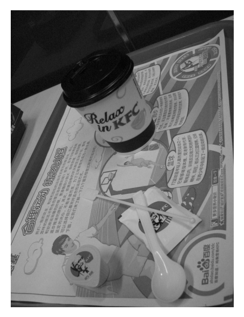
Image 13 and 14. Some efforts of Western brands to localize their offerings are more explicit. Unlike the tray liners in the United States, the tray liner in the Beijing KFC contains information/tips on how to exercise wisely. Parts of the KFC tray insert read: "Exercise reasonably and frequently" and "We have changed for China and created new fast food. To have a foothold in China, we strive for endless innovation, and delicious and safe food that is good and fast while balancing nutrition for a healthy life." Other information offers instructions on how to exercise. The coffee cup reads in English "Relax in KFC," conveying its localization, in contrast to the "fast-food" notion of the West.