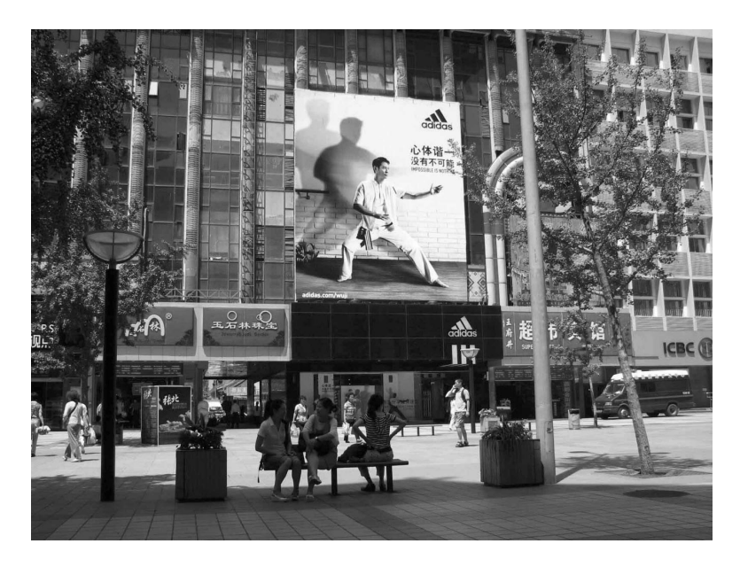
Image 10. Contrasting Nike's use of Western athletes in advertisements, here Adidas localizes its appeal through use of both an Asian model and a martial arts context.