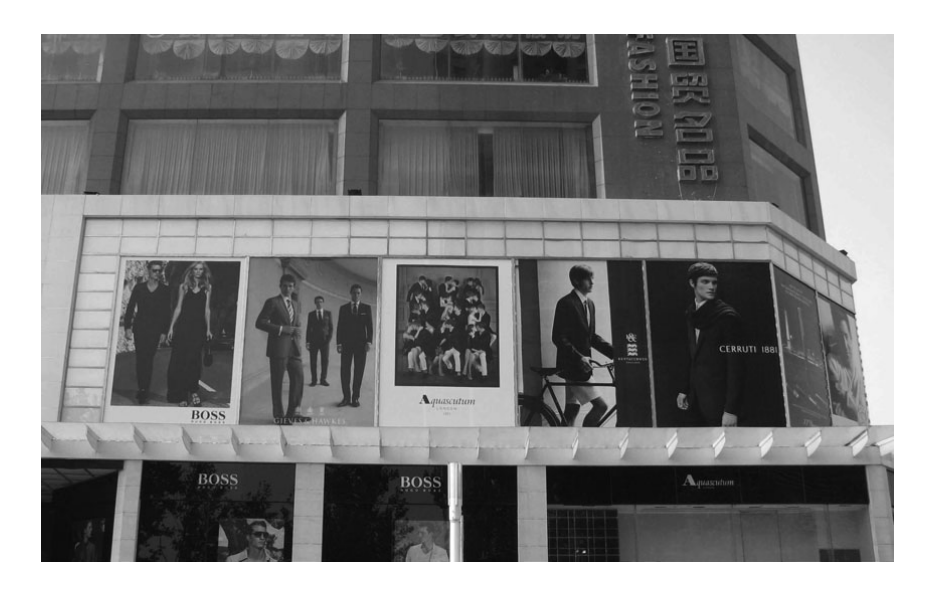
Image 11 and 12. Kissing in public is considered as belonging uniquely to Western culture and lifestyle. A London-based Western brand features kissing on its billboard affixed to a multi-story store building that sells specifically expensive "internationally famous brands."