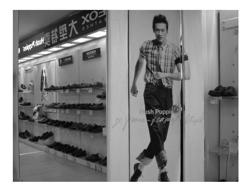
Image 9. Western shoe brand, Hush Puppy, uses an Asian model to localize its appeal while using the English language slogan "50 years of casual style" to designate foreignness. The slogan references the brand's history of casual style that predates China's economic reforms.