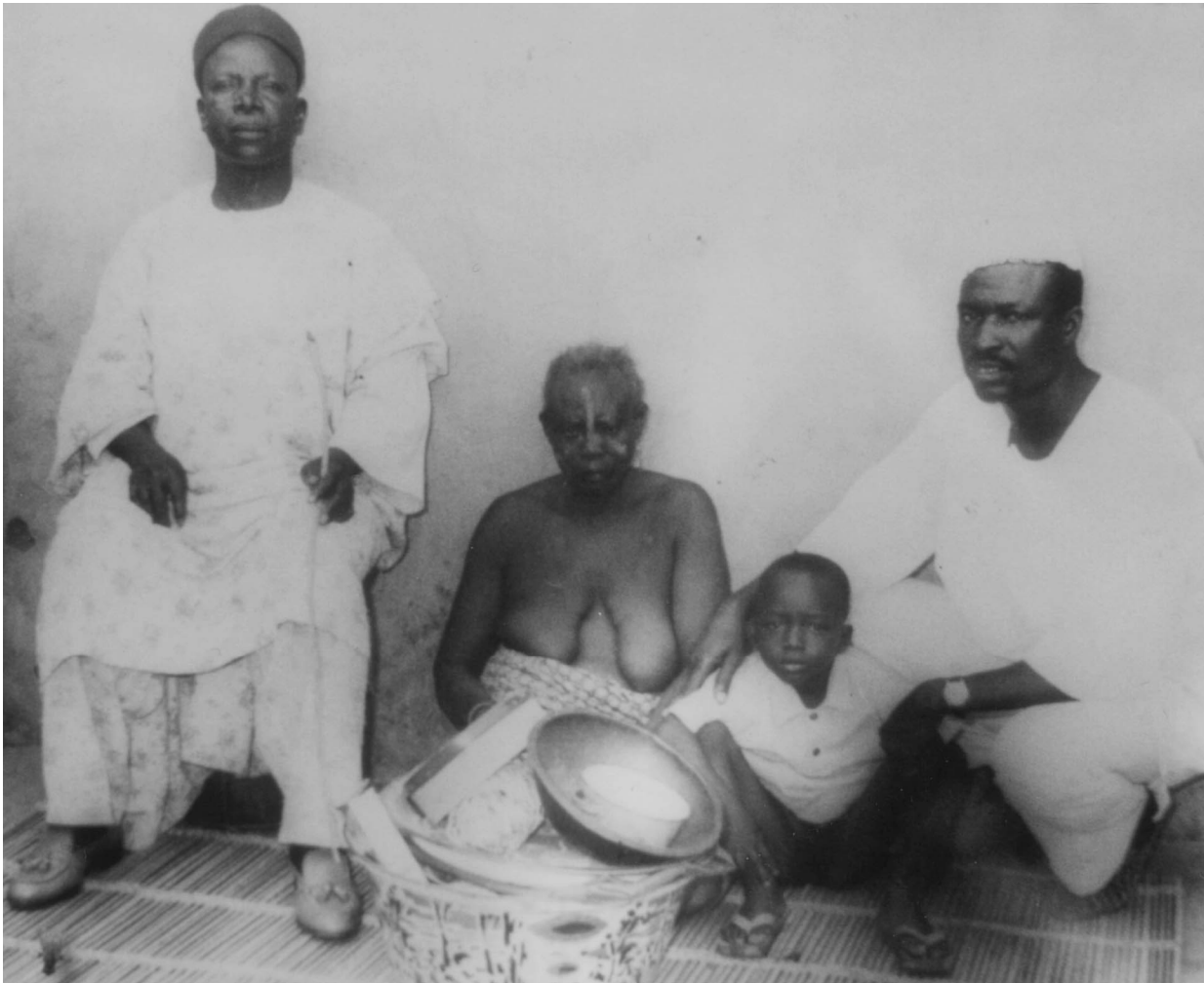
Fig. 5: A convicted 'witch' - One of the three framed photographs of detected 'witches' displayed, together with a diploma, certifying that the owner was a recognised witch-doctor, on the wall of the compound of a boci in Mokwa in 1982.

was accused of having bewitched her son and husband „to give his mother money“, i.e. to guarantee the social security of his mother. In another case a small schoolboy fell seriously ill. He was allegedly bewitched by a barren older woman living in the same compound, said to be jealous of the fertility of her female co-residents. In both cases, the accused women „confessed“ their evil deeds and loosened their spell, i.e. their „victims“ recovered from their illness. 85 Whether these confessions were made without coercion is doubtful, last but not least, because my informants in Mokwa agreed that if an accused person tried to argue, he or she would be forced to prove his or her innocence by an ordeal, applied either by the ndakógbòyá or a boci . In the Mokwa region the accused was given a certain potion, called fien or tagan , which is meant to cause him to confess im-