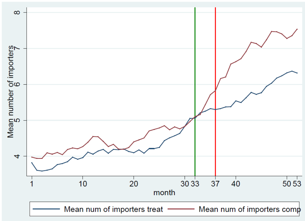
Figure 2: Average number of importers in treatment and comparison group