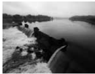
TNC: Integrated Reservoir Floodplain Management, Georgia and South Carolina, USA