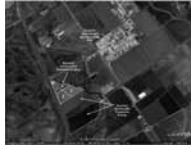
Dow: Constructed Wetland for Waste Water Treatment, Texas, USA