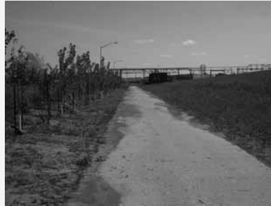
Sarnia Site, the Dow Chemical Company

Geographical location: Sarnia, Ontario, Canada