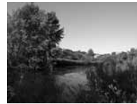
TNC: Managing Storm Water Runoff with Wetlands, Philadelphia, PA, USA