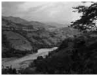
TNC: Cauca Valley Water Fund, Cali, Colombia