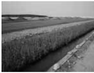
Shell: Produced Water Treatment Using Reed Beds, Nimr, Oman