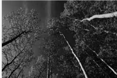
The Dow Chemical Company

Geographical location: Houston-Galveston-Brazoria (HGB) area near Dow's Freeport Texas Operations