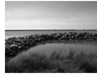
Shell and TNC: Coastal Pipeline Erosion Control Using Oyster Reefs, Louisiana, USA