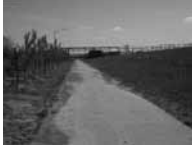
Dow: Phytoremediation for Groundwater Decontamination, Ontario, Canada