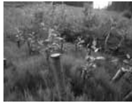
Shell: Natural Reclamation and Erosion Control for Onshore Pipelines, NE British Columbia, Canada