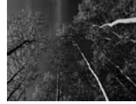
Dow and TNC: Air Pollution Mitigation via Reforestation, Texas, USA