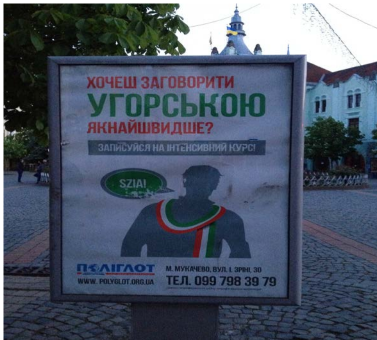
Figure 3: Poster advertising a Hungarian language course in Mukacheve (May 2016)

of the country's kin-state policies. Moreover, via diversified gesture politics, the country is not merely nurturing good neighbourly and interethnic relations but – after the weakening of Ukraine owing to the post-Maidan events – taking actions in order to recruit a fresh active labour force among Transcarpathian Hungarians and Ukrainians.