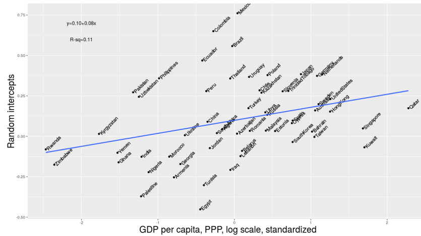
Figure 2: Random intercepts and GDP per capita

given smaller residuals of other countries which are similar to them in terms of geographic, social and economic characteristics, a regional or cultural pattern cannot be readily inferred. Yet ongoing civil conflicts and political instability are among possible explanations for unusually lower levels of SWB. Overall, average income explains only part of the international differences in SWB, and the remaining variation is likely to result from unobserved national or regional characteristics.