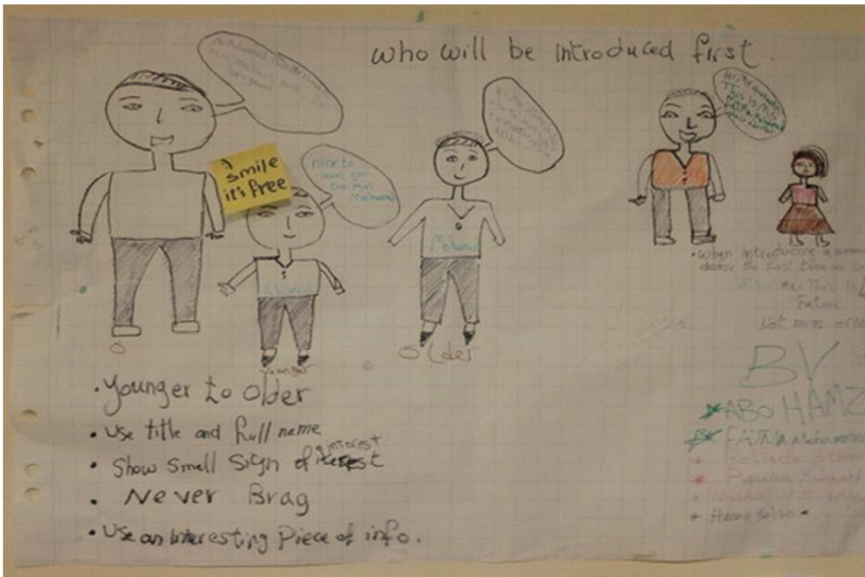
Figure 1 – a student-designed poster stemming from an exercise in which students learned how to introduce themselves in a professional way.

Participants were also told that the future was in their hands: if they worked hard, addressed their skill weaknesses and remained positive, they would achieve a successful 'career' or become a successful entrepreneur. They were thus told to dream big. They would do this through conducting SWOT (strengths, weaknesses, opportunities, threats) analyses, or practicing time management. Egypt's private sector is now 'meritocratic', they were told: it rewards hard work and skills rather than 'wasta' (nepotism) and class upbringing. This was 'proved' by the stories of the teachers themselves, who described how their own hard work and perseverance had secured their career advancement. They neglected to openly discuss their own privilege, such as private education.