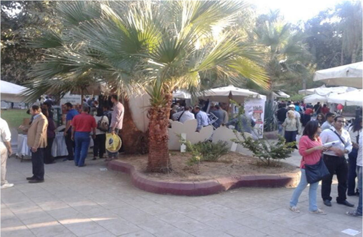
Figure 2 – UN Day Fair

My informants also read extensively online about international entrepreneurs, like Steve Jobs, reposting their inspirational quotes on their Facebook pages (see Figure 3). In these entrepreneurship events, they would be told that entrepreneurs need to have an entrepreneurial mindset, to be risk-takers, to be passionate, to be hard-workers, to believe when others doubt in order to be successful, to find funding, or establish useful connections. During my own interviews with employees in this entrepreneurship scene, who were all internationally and/or privately educated, they were keen to tell me to be more hopeful about the futures of my participants, and stress that ‘anyone’ can become an entrepreneur.