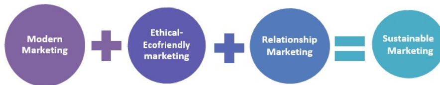
Figure 2: Modern to Sustainable Marketing

According to them, the entire process of marketing starting from market research to identify needs of the customer till loyalty building should have sustainability vision. The authors argued that to develop sustainable vision, it is important to merge previous sets of marketing ideas to create concept of