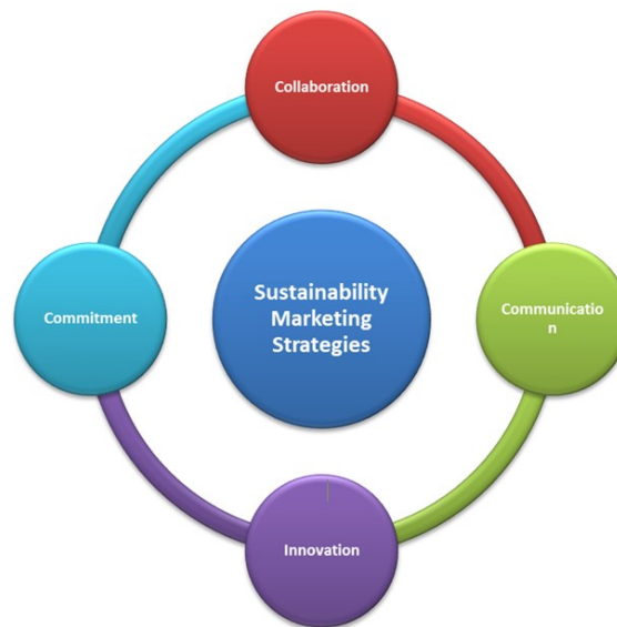
Figure 5. Proposed Sustainability Strategies for Fulfillment of Consumers' Expectation and Generating Business Value

First companies must prompt innovation in all their spheres. To meet broader needs of consumers and align with business value, companies should incorporate innovation in products, services and process. If the innovation genuinely improves lives, health and community well-being then consumers develops deeper connection with companies. These innovations should lead to efficacy and cost saving for consumers and organizations. Popular examples include hybrid cars, LED or CFL bulbs that meet consumers' expectation without compromising the organizational performance.