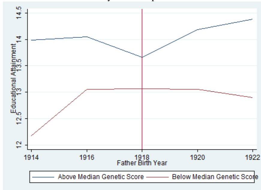
Figure 1 Effects of Paternal In Utero Influenza Exposure on Child's Educational Attainment Results stratified by Median Split of Genetic Score

Notes: Birth Year Collapsed into two-year cells. Plots show unadjusted means.