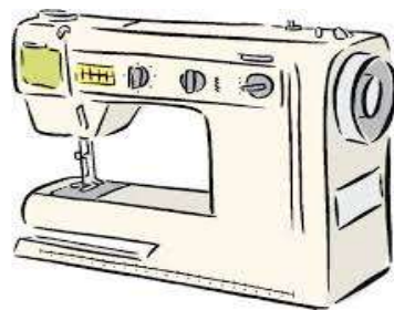
Figure A1: Recruitment advertisement