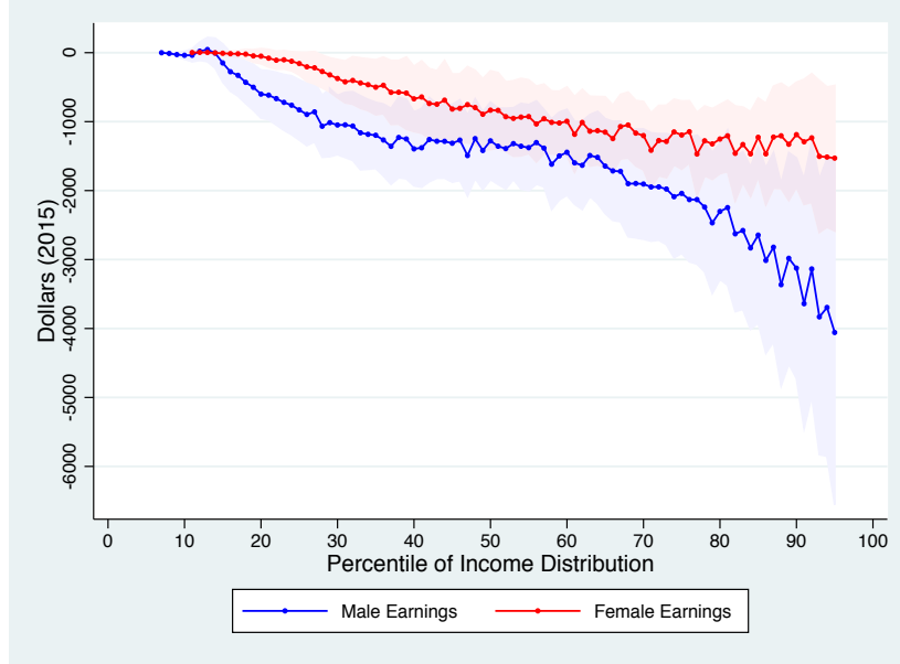
A. Impact on Male and Female Annual Earnings by Percentile, 1990-2014