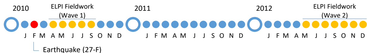
Figure 1. ELPI Timeline

We construct our final sample from the second wave of the ELPI survey and include only children who were in-utero on 27-F and children who were conceived after the earthquake. When the test instruments were applied in 2012, children in our sample are aged between 7 to 36 months.