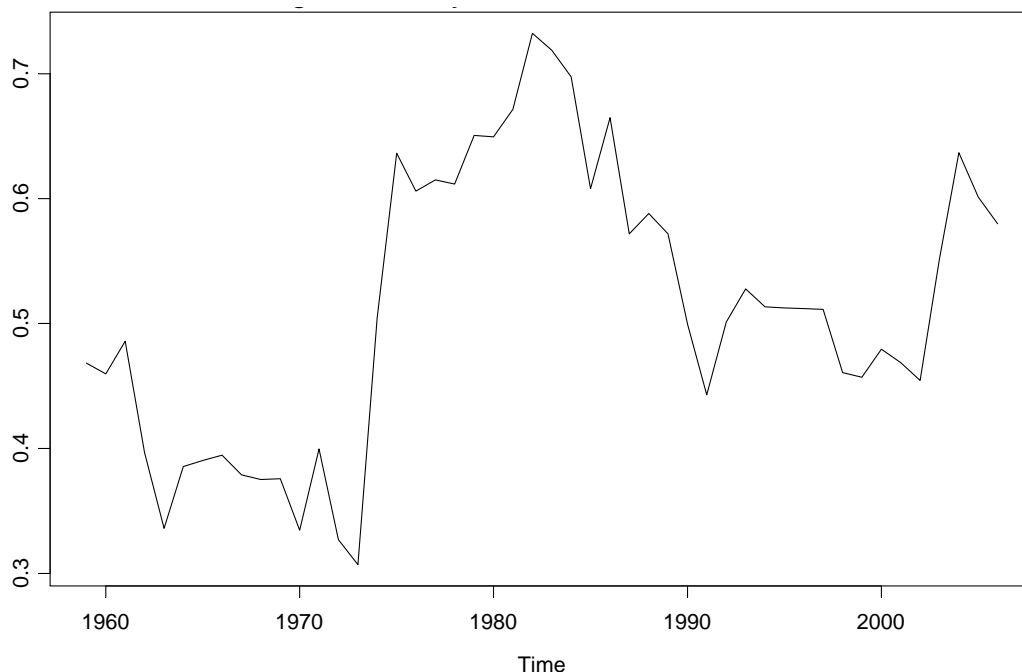
Figure 3: The Temporal Evolution of the Degree of Convergence for the Main World Economies, 1948–2006

Note: This uses a 12 year window of data for the United States, the United Kingdom, Germany, France, Italy and Japan. It plots the evolution of the maximum eigenvalue as a proportion of the sum of the eigenvalues of the correlation matrix of annual growth rates.