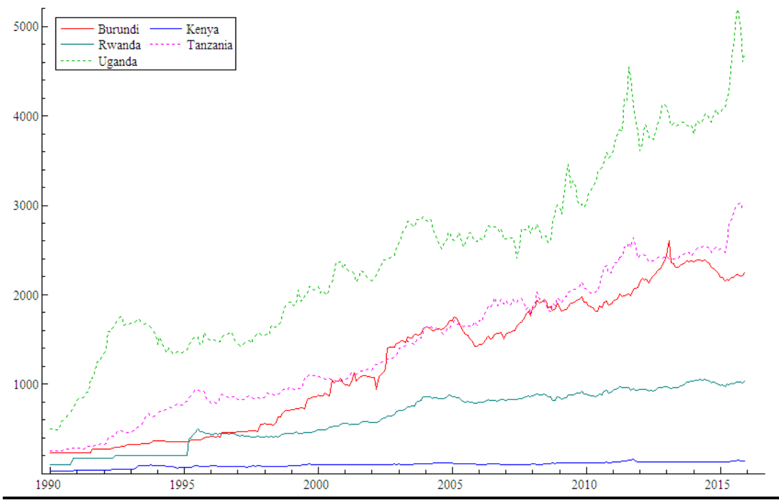
Figure 1: Real Exchange Rates of the member countries of the EAC