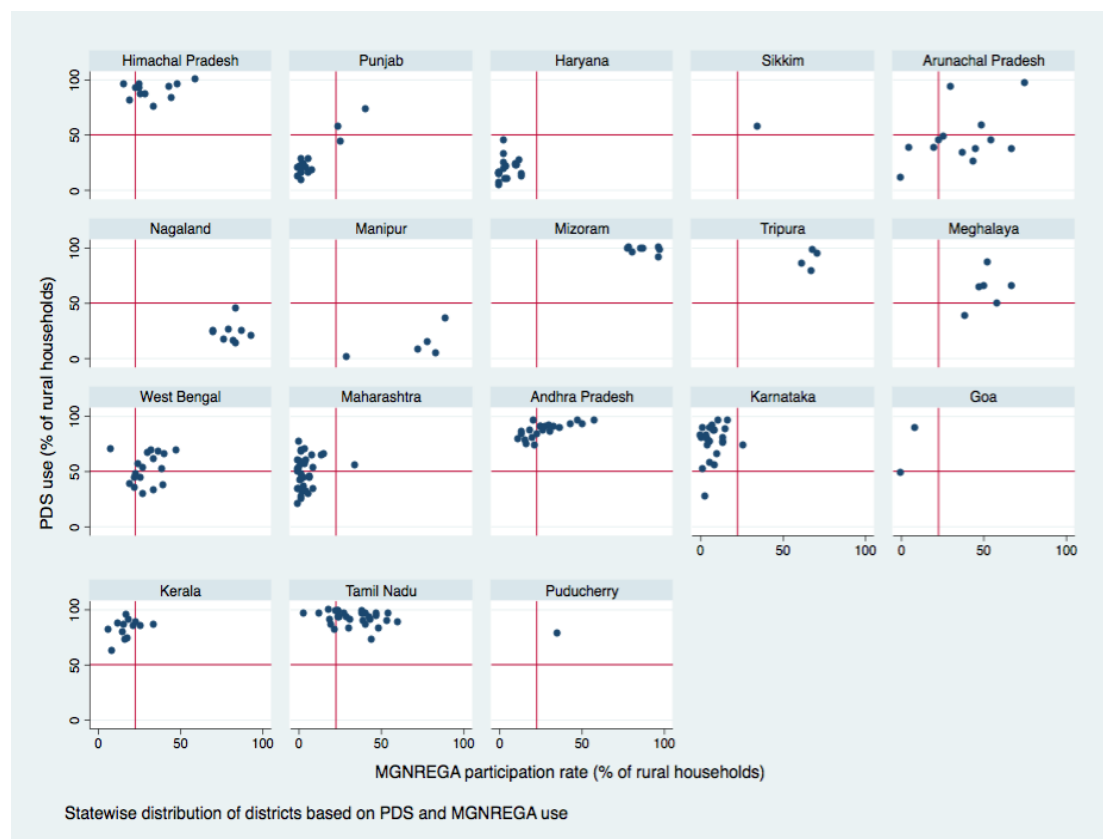
Figure 1: District level scale of MGNREGA and PDS, grouped by state (2011-12)

Figure 1 shows the pattern of scale of implementation of the MGNREGA and PDS in the districts, grouped by state, relative to the All-India average. It appears that the scale of implementation of the PDS and MGNREGA are only modestly correlated (0.288 in 2011-12). When a state has districts with relatively large PDS presence, this does not necessarily imply that these districts also have a large MGNREGA presence and vice versa. This allows for the possibility of separating their effects and exploring the interactive impact of these two programmes. While states such as Tamil Nadu, Andhra Pradesh, Himachal Pradesh have above average programme reach in both the PDS and the MGNREGA, at the opposite end are Punjab and Haryana with neither. States such as Karnataka, Maharashtra have better implementation in one programme rather than the other.