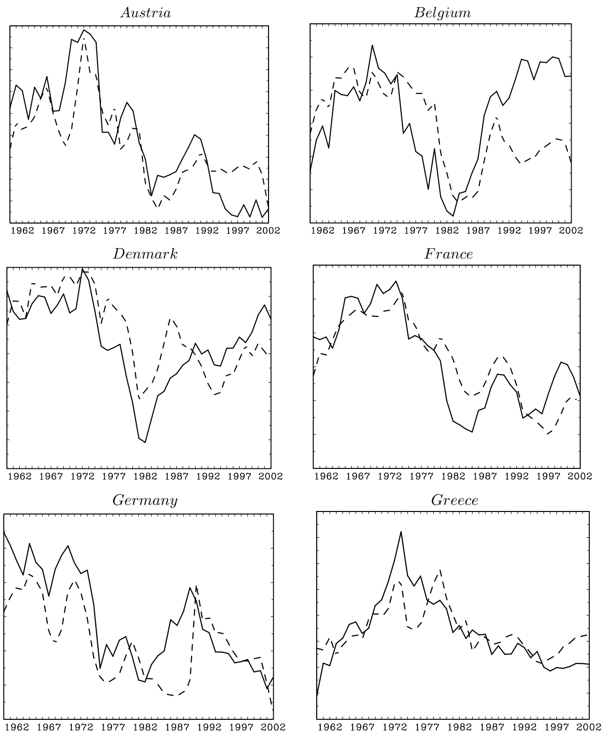
Figure 3: Savings/GDP (solid line) and Investments/GDP (dotted line), 1960-2002.