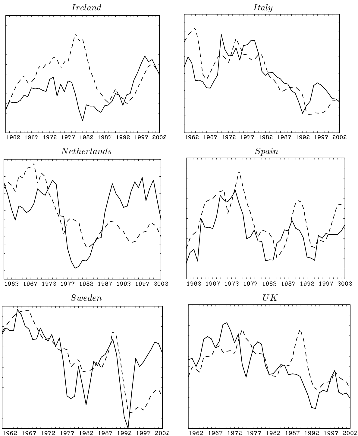
Figure 4: Savings/GDP (solid line) and Investments/GDP (dotted line), 1960-2002.