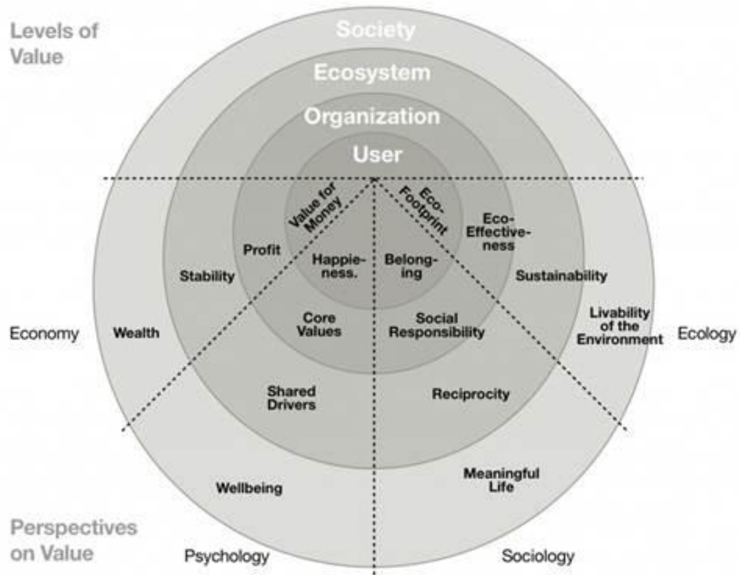
Figure 2.: Levels and Perspectives of Value Creation and Value Capture.

Further research may explore the specific mechanisms for value co-creation in an SME global network of suppliers, buyers, and customers. Such research requires extensive interviews with different network partners in order to differentiate the specific ways in which economic, psychological, sociological and ecological value is created and co-created and how context affects these mechanisms and their combination.