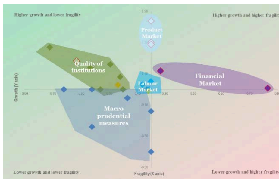
Figure 1. Policy areas in a growth-fragility framework

Note: The different points refer to specific structural policy reforms within the category described in the headline for the area to which they belong (see the paper quoted as source for their detailed identification). Structural policies should be assessed on the basis of their effect on growth and economic fragility. In this chart, the effect of policies on economic fragility is plotted on the horizontal axis, the effect on growth is shown on the vertical axis. Fragility is defined as a higher likelihood of financial crises (banking, currency, or twin crisis) or a higher GDP (negative) tail risk. Different risk-growth patterns emerge for each policy area considered—pro-growth labour and product market policies improve economic performance without substantially affecting economic fragility. Better quality of institutions both increases growth and reduces economic fragility. However, macroprudential and financial market policies entail a growth-risk trade-off—the former decrease economic risk to the detriment of a higher growth rate, the latter promote growth but also increase financial risk.