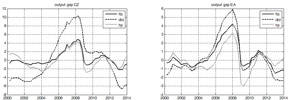
Figure 2 Output Gap, horizontal axis - timeline, vertical axis - output gap as a percentage deviation from the trend

In general, it holds that the results of FTS variants with lower values attributed to trend shocks converge to the results of the DLD model while the results of FTS variants with higher values attributed to trend shocks converge to the results of the HP filter. In my view, therefore, the FTS model output gap is capable of providing a plausible description of the business cycle in both economies.