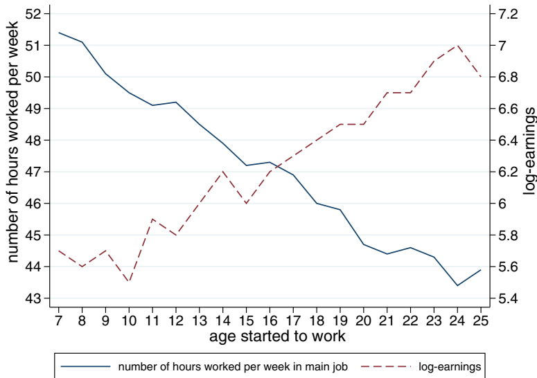
Fig. 1. Averages of the logarithm of earnings and number of hours worked per week in main job according to the age at which an individual started to work, for Brazilian males aged from 25 to 55 years old, 1988 and 1996 (pooled data).