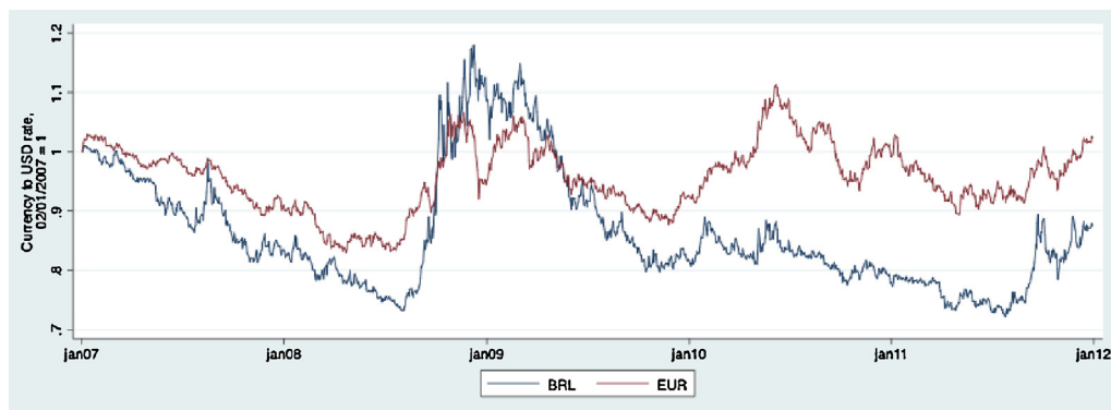
Fig. 2. Exchange rate variation (2007–11).