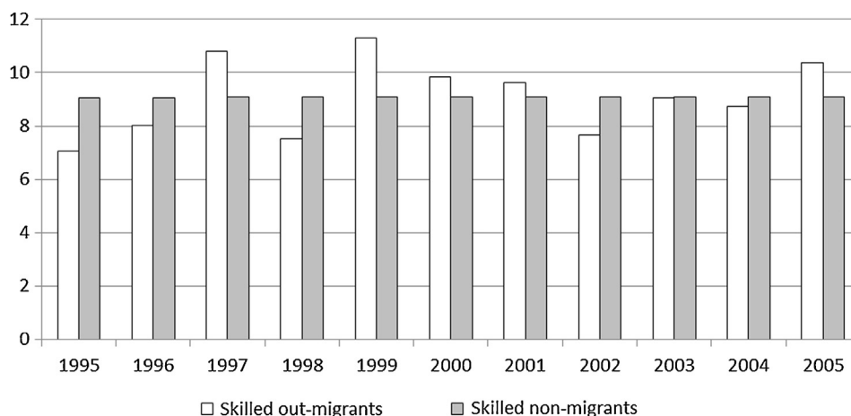
Chart 3. Skilled labor force out-migration in the period 1995–2005.

It should be emphasized that the specification presented previously for both comparison groups was estimated by means of a logit model using the method for both fixed effects and random effects, which took non-observed effects into account. Choosing between fixed-effects and random-effects methods was dependent on the Hausman test.