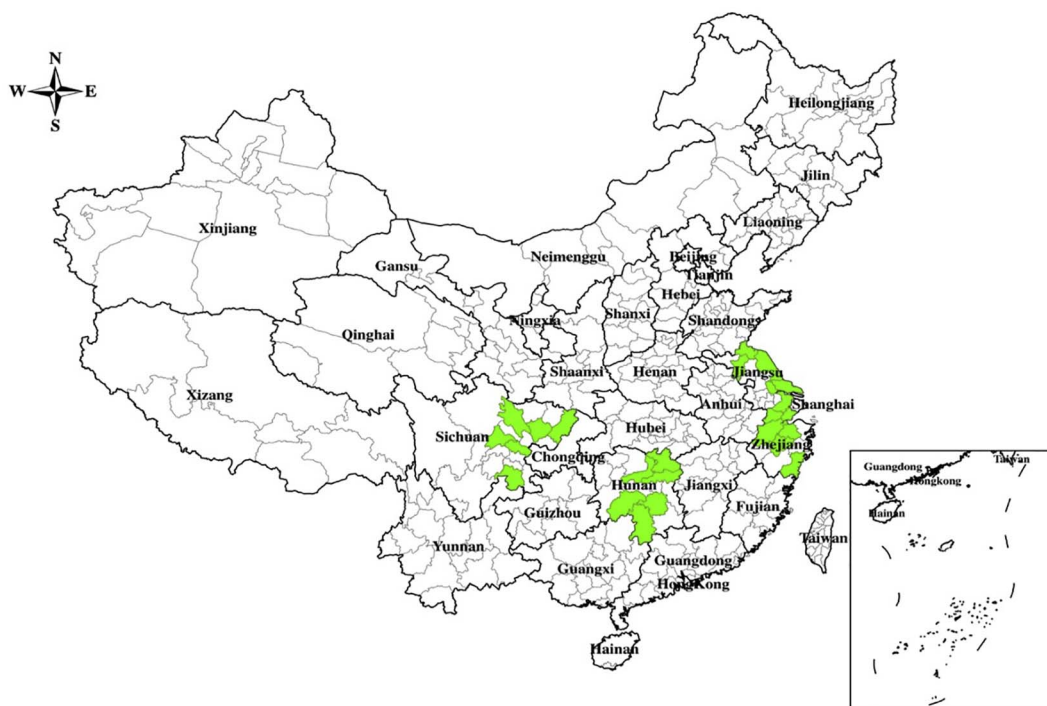
Fig. 3. Map of China and four sample provinces.