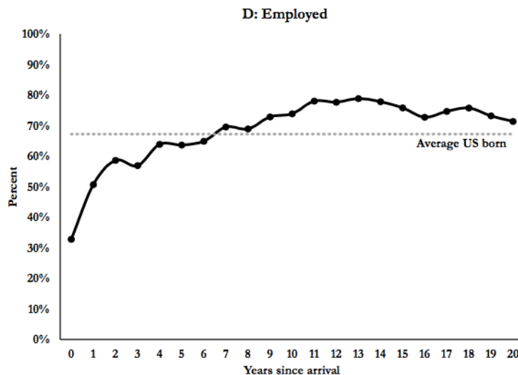
Chart 2: Outcomes of refugees that entered the U.S. at ages 18–45 as a function of years in the U.S., compared to U.S. born adults, 18–65

Evans and Fitzgerald (2017) estimate that the fiscal cost of resettling a refugee in the United States initially is approximately $10,000 (2007). To this cost are added those of various social safety nets, which average about $6,000 a year over the first 8 years and decline gradually thereafter. The refugee typically finds work after a brief period and contributes minimally to the tax take (sales, real estate, social security, Medicare and income taxes) from the first year, with the tax take exceeding $6,000 each year, by year 8 after arrival. After year 8, the refugee is budget-positive on a cash-flow basis and has ‘paid-back’ by year 13 or so. Using a discount rate of 2%, the authors estimate that those who enter the country between ages 18–45 pay on