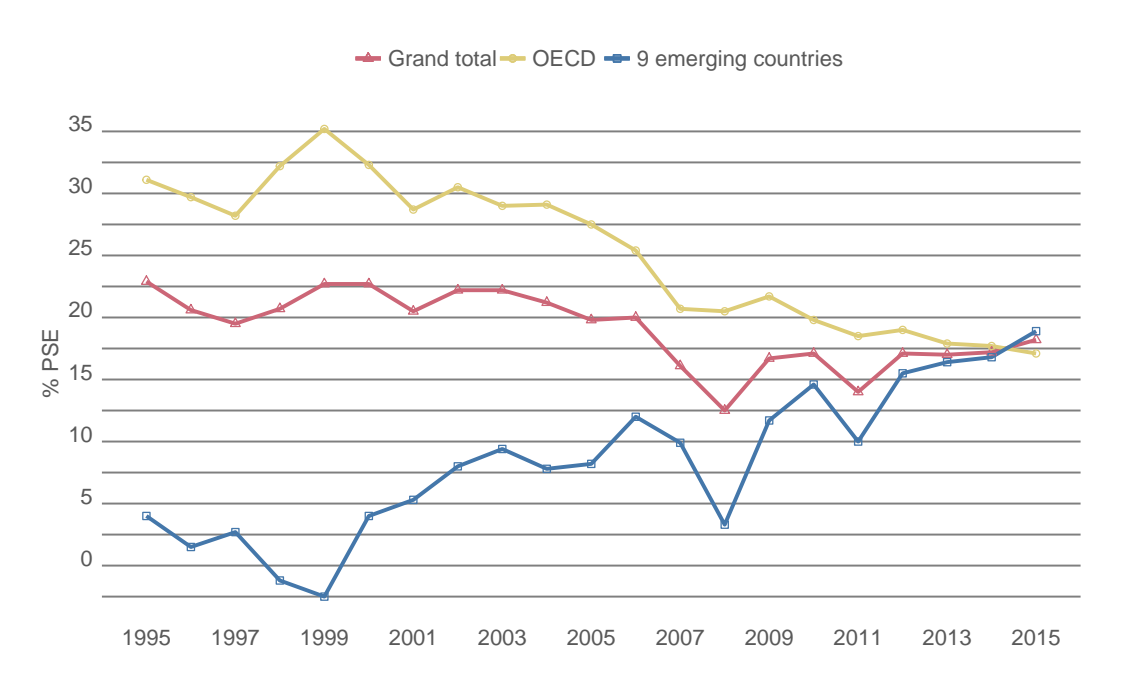
Figure 1: Evolution of Producer Support Estimate (PSE) , 1995 to 2015 (percentage of gross farm receipts).

Notes: The OECD total does not include the non-OECD EU Member States. The Czech Republic, Estonia, Hungary, Poland, the Slovak Republic and Slovenia are included in the OECD total for all years and in the EU from 2004. The emerging economies are Brazil, China, Colombia, Indonesia, Kazakhstan, Russia, South Africa, Ukraine and Viet Nam. Viet Nam is included from 2000 onwards.