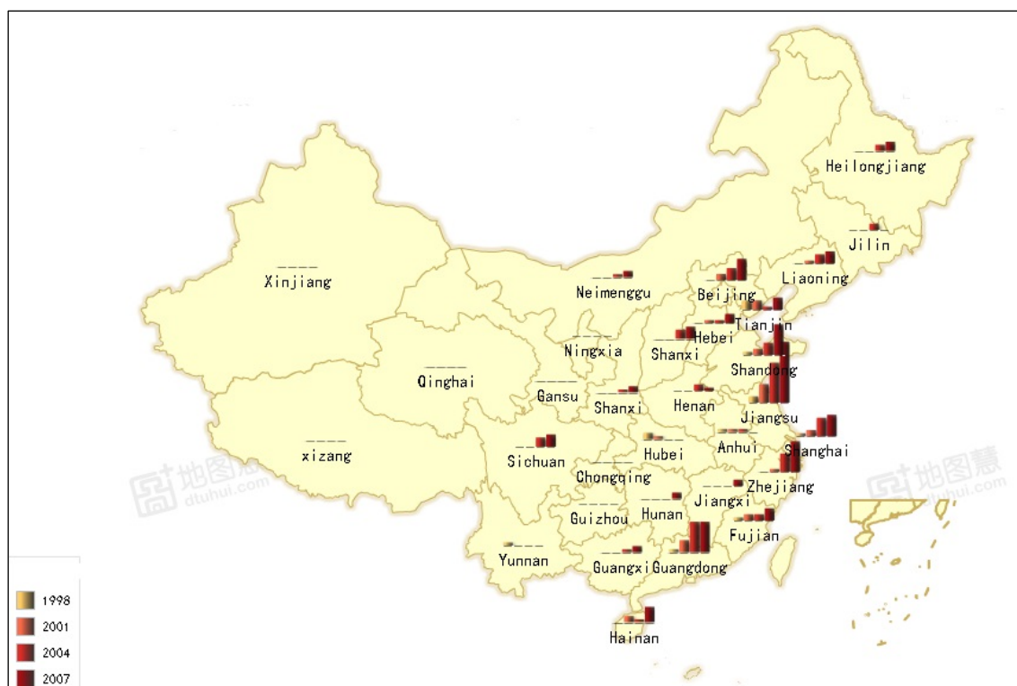
Figure 2: Location of Fortune 500 Pharmaceutical Firms in the People's Republic of China, 2001–2010

In this subsection, we discuss two robustness checks. First, we employ an alternative measure of foreign firm penetration as an explanatory variable. We look into the Fortune 500 pharmaceutical corporations over the period 2001–2010. We collect the information on the location of their subsidiaries and starting operation year in the PRC from their company websites. We cross-check the location information with various transnational corporation reports in the PRC, which report information about local subsidiaries (including starting operation year, location, and ownership) for Fortune 500 corporations.