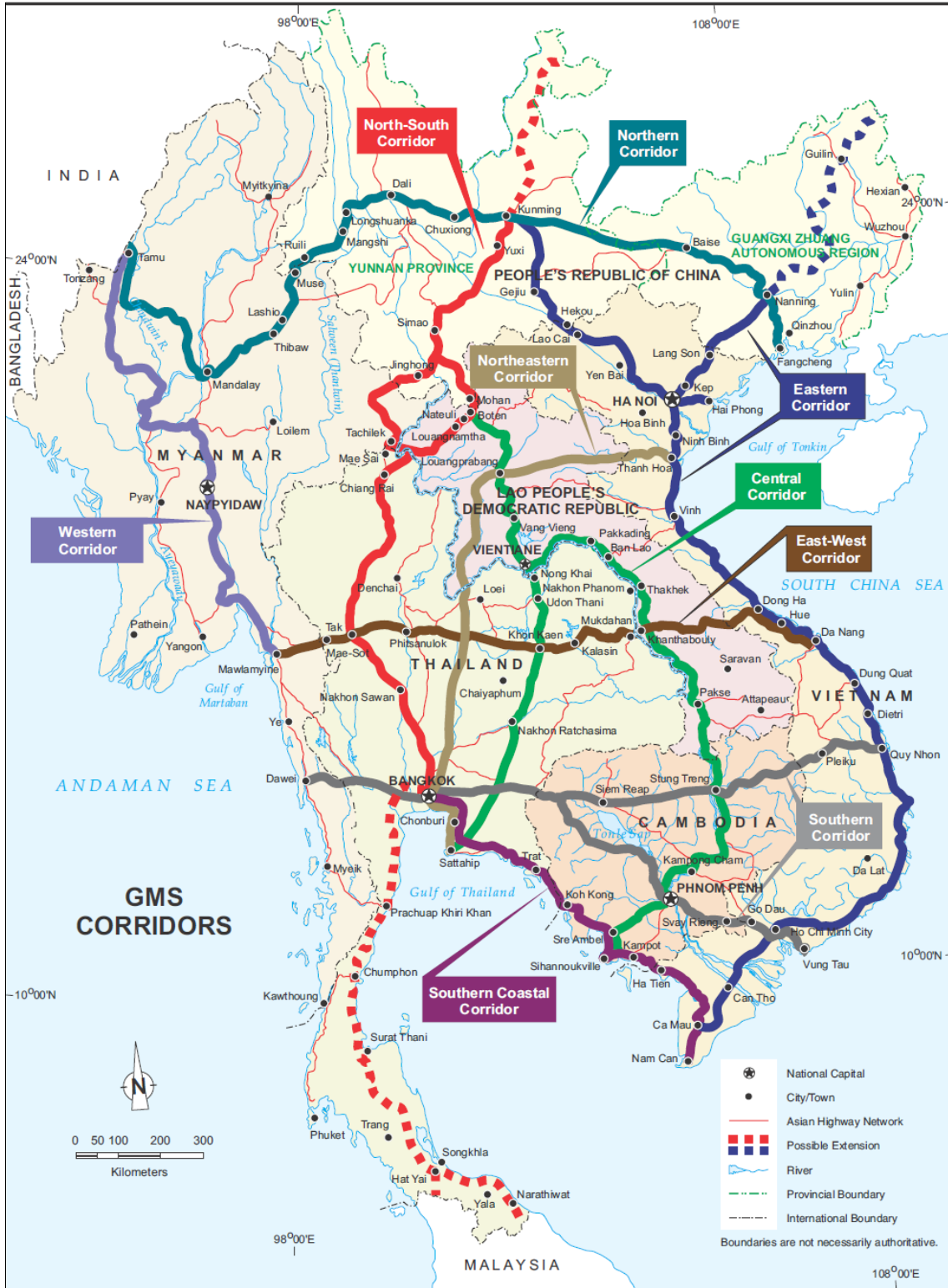
Figure 1: Economic Corridors in the GMS