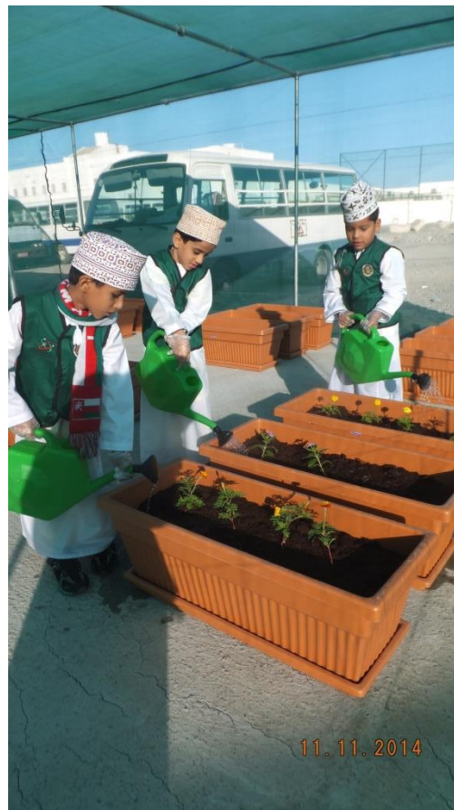
Figure 2. Children watering plants in a school in Oman

Questionnaires have been developed for students, teachers and parents. These have been adapted from existing questionnaires employed by Block and Johnson (2009) in their evaluation of the Stephanie Alexander Kitchen Garden Program in Australia. These instruments will be used to determine how much knowledge these groups have about growing fruit and vegetables, the health benefits of including fruit and vegetables in one's diet and the environmental and economic benefits of schools and home gardens. This data will be supplemented by interview data from a subset of the same participants. These data sources will allow for triangulation of the findings.