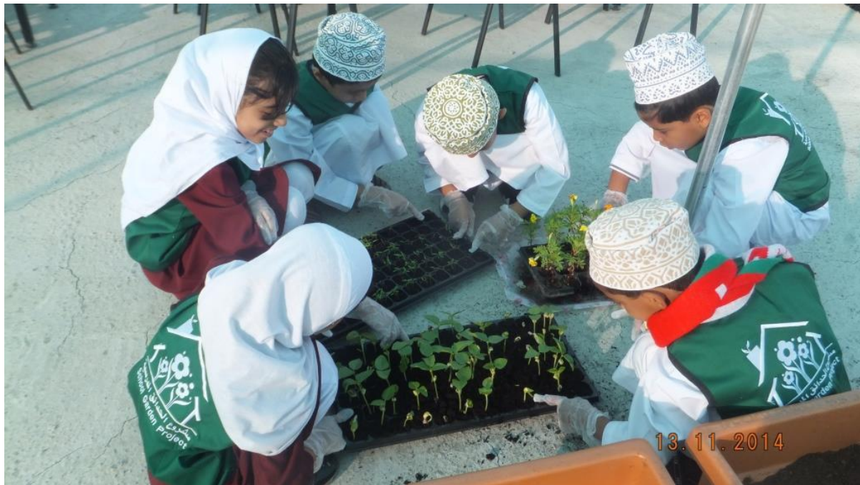
Figure 3. Children planting flowers in a school in Oman

In this phase, the researchers will work with each of the six selected schools to establish the gardens. Some schools may have grounds and soil suitable for establishing gardens directly, but where soil is poor, gardens will be established in raised beds. Compost bins will also be established in each school to provide an ongoing source of soil for each garden.