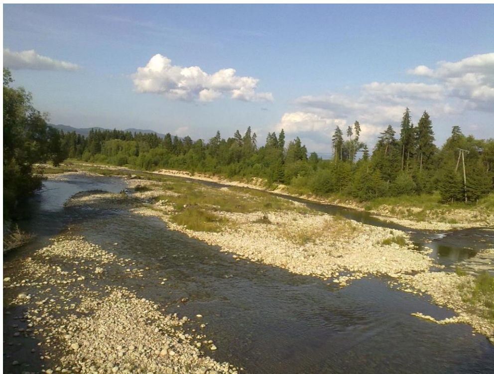
Figure 2: Bialka river valley, PLH120024 Natura 2000 site