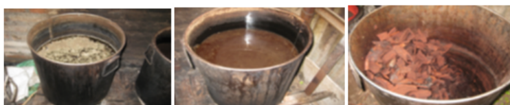
Figure 3: Extraction process of natural dyes in 'Batik X' SME

The extraction process for each of the natural dye is simple. The plant is being boiled in water for an hour and then filtered. The product for one extraction process can then be used for a week for a few batik colouring. Extraction for indigofera is different. The leaves and branch of indigofera is cut, bound together and soaked one day for fermentation process. The next day, it is being aerated and kapur tohor is being added to the water to bind indigofera's colouring agent, indigotin. The fixative dye would then react for one day and being filtered afterwards. This process would result in a form of paste. A reducing agent of brown sugar would then be added for a whole day to reduce the indigotin so that the paste is ready for use.