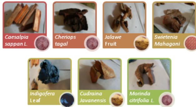
Figure 2: Sources of natural dyes used in 'Batik X' SME (Source: Case Study, 2014)

Natural dyes that were being used for this SME are secang tree ( Caesalpia sappan l. ) for red colour; tingi tree ( Cheriops tagal ) for red colour; rind of jalawe fruit for yellow colour; mahagoni tree ( Swietenia mahagoni ) for pink colour; indigofera leaf paste for blue colour; tegran ( Cudraina javanensis ), root bark of mengkudu ( Morinda citrifolia l. ) for red colour; and soga , which is combination of tegran , tingi and bark of jambal tree, for brown colour.