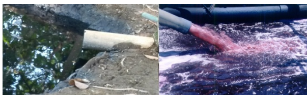
Figure 4: (Left) 'Batik X' – natural dyes wastewater, (Right) Batik - synthetic dyes wastewater

According to the resource person, each of the process of batik processing with natural dyes does not produce any hazardous waste. Pre-treatment or mordanting is using alum which is normally used for water treatment. The waxing process is using wax that is formed with pine tree latex, white wax, Agathis dammara tree, fat and paraffin. The wax can be reused by heating it so that it would be fluid again. The colouring process is using natural dye which was generated from plants, so the wastewater does not cause any damage to the environment. The SME is using landfill process for the wastewater so that the solid residues from the wastewater can be used as fertilizers. Compared to synthetic dyes wastewater with high level of COD and hazardous compounds, natural dye is very environmental friendly.