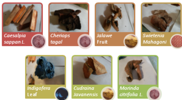
Figure 2: Sources of natural dyes used in 'Batik X' SME

Natural dyes that were being used for this SME are secang tree ( Caesalpia sappan L. ) for red colour; tingi tree ( Cheriops tagal ) for red colour; rind of jalawe fruit for yellow colour; mahagoni tree ( Swietenia mahagoni ) for pink colour; indigofera leaf paste for blue colour; tegran ( Cudraina javanensis ), root bark of mengkudu ( Morinda citrifolia L. ) for red colour; and soga , which is combination of tegran , tingi and bark of jambal tree, for brown colour.