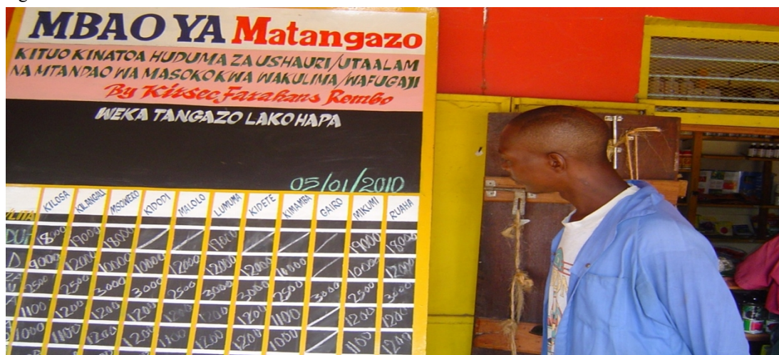
Figure 2: Information board at KIRSEC

LINKS stands for Livestock Information Network Knowledge System, a web based livestock marketing Information System. Its development started in 2005 under the Global Livestock Collaborative Research Support Project (GL-CRSP) funded by USAID. This system is used by Tanzania, Kenya, Uganda and Ethiopia, with each country run its own system. For Tanzania LINKS is under mandatory of Government of Tanzania through the Ministry of Industry and Trade since June 2009. In Tanzania, the system covers 53 livestock markets of which 41 are primary livestock markets and 12 are secondary livestock markets spreading over all districts (CNRIT, 2013).