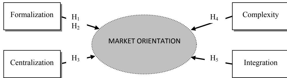
Figure 1. Conceptual model

To sum up, the theoretical review carried out leads us to set out a conceptual model of relationships between variables in which it is proposed that the degree of a firm's market orientation is determined by a series of antecedents relative to the organization's structure, such as formalization, centralization, complexity and integration.