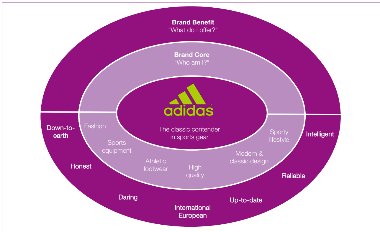
Figure 3: Adidas brand personality model

and stand for a sporty lifestyle. However, in terms of design, Adidas can be seen as a rather modern and classic one than a really innovative one. In the case of brand personality, Adidas and Nike are quite different. Brand personality attributes of Adidas are also based on the most suitable of the Aaker model, but the dimensions are more balanced than the one of Nike. The sincerity dimension with the down-to-earth and honest facets are appropriate for the Hero, but it doesn't show his main character. It is similar for the competence with its facets reliable and intelligence. The aspects of Adidas personality are definitely important for a hero, but not necessarily the most important or influential ones. These dimensions are rather for being hard working and respectful. For Adidas, the excitement facets are daring and up-to-date. Adidas can rather be seen as the reliable, clean, and nice Hero. He is competing and fighting together with others as a team. But Adidas is lacking some crucial points of the Hero like for example, winning at all costs. In contrast, Nike is more the tough and brave fighting Hero who is earning his success with a lot of hard work. It is more about