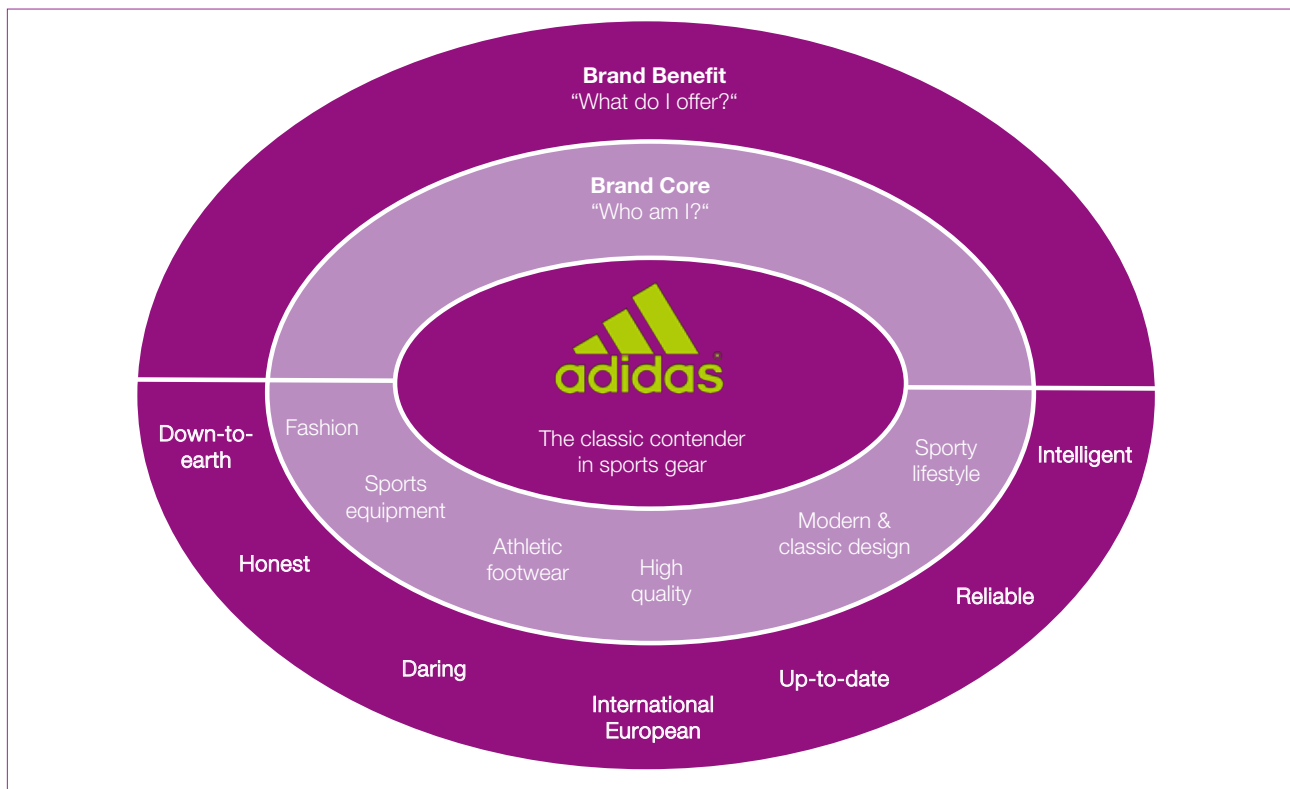
Figure 3: Adidas brand personality model