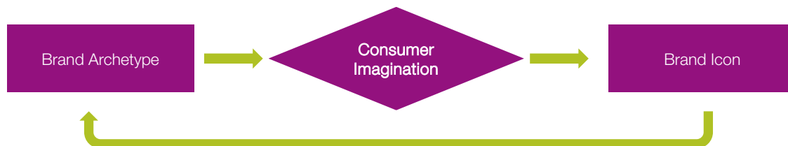
Figure 5: Brand archetype-icon framework

Using an enduring brand archetype which is shaping consumer imagination with different stories is key for becoming a really iconic brand. This transformation is rather cyclical than linear because the brand has to present regular adaptations of their storytelling. A company which is such an iconic brand is Nike. They experience a strong consumer relationship and loyalty due to their impressive representation of the hero archetype in combination with the marketing of successful athletes like