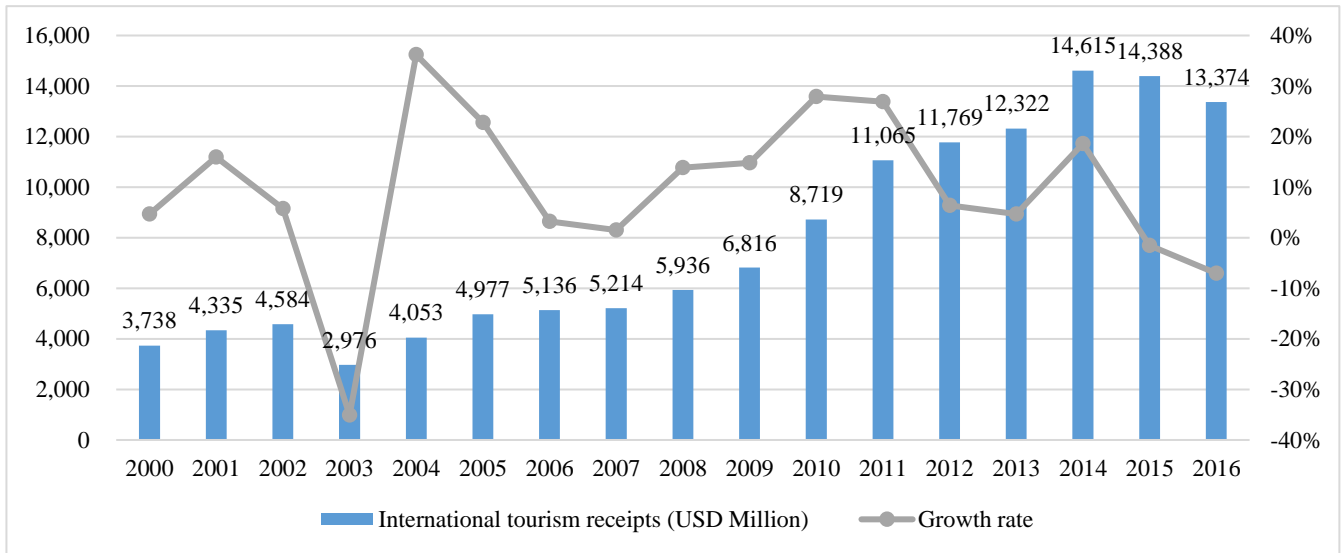
Figure 1 Taiwan's International Tourism Receipts and Growth Rate from 2000 to 2016