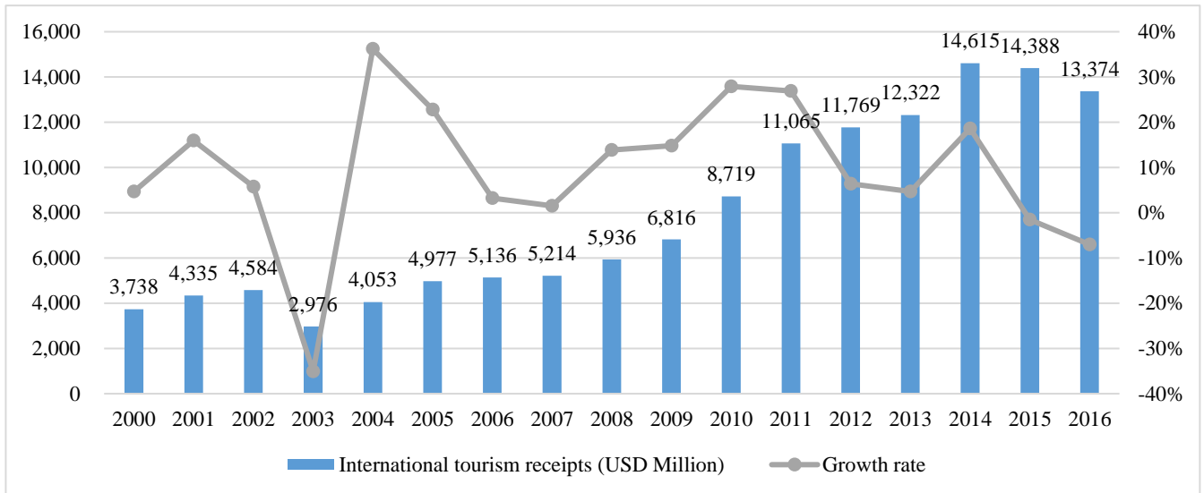
Figure 1 Taiwan's International Tourism Receipts and Growth Rate from 2000 to 2016