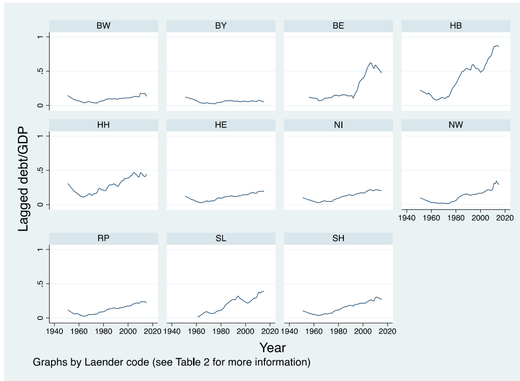
Figure 2: Panel Time Series of Main Explanatory Variable of West German Laender 1950-2015